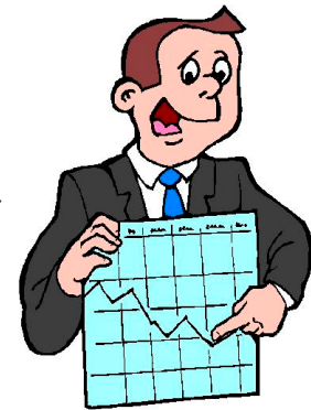
Future rate reductions

Companies pay corporation tax on any capital gains they make, but individuals pay CGT, (now at 28% for higher earners). If you have a choice between holding a commercial property in your own name, or within your company, the company may pay less tax on any future gain. Discuss the issue with us before you buy.